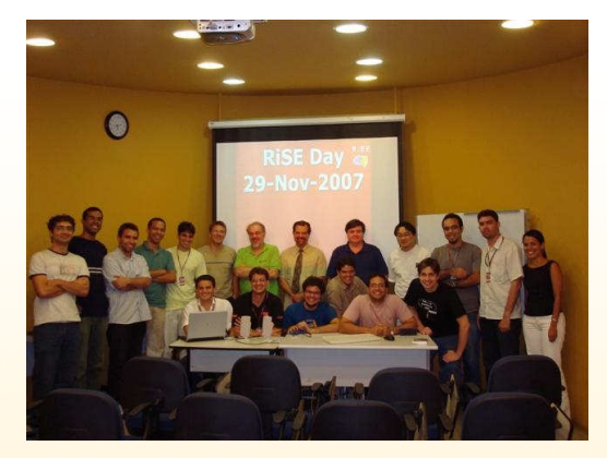
RiSE Team (PhD and Masters) and International Reuse Specialists from US, Germany and Sweden